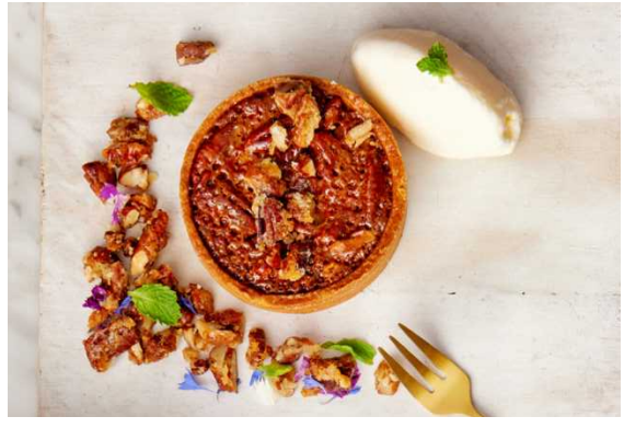
Pecan Tart with Vanilla Ice Cream