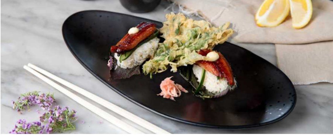
Unagi Roll with Crispy Kale and Kewpie Mayo

Japanese-style caramelised free-range chicken (4 skewers).