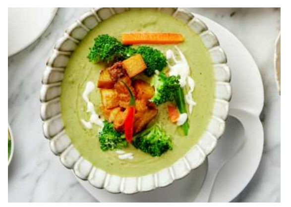
Thai Green Curry withe Crispy Pork Belly