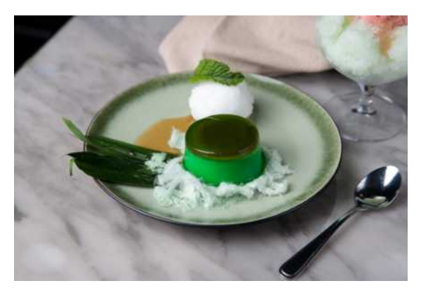
Caramel Flan with Citrus Sorbet