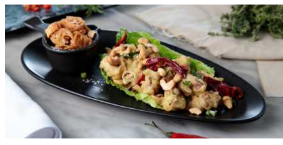
Firecracker Sichuan Chicken

🛞 Gluten Free 🕜 Dairy Free 🥒 Spice Level