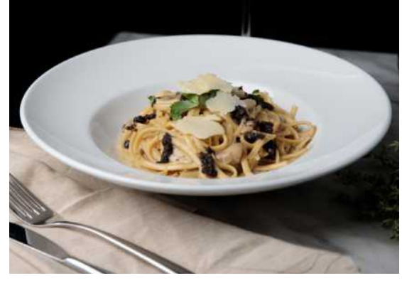
Truffle and Porcini Linguini